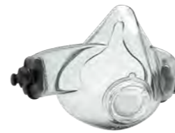
Half Mask (includes head harness) CST1034 - Small CST1035 - Medium CST1036 - Large