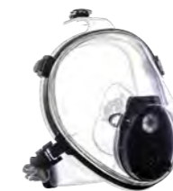
Full Face Mask CST1017 - Small CST1018 - Medium/Large