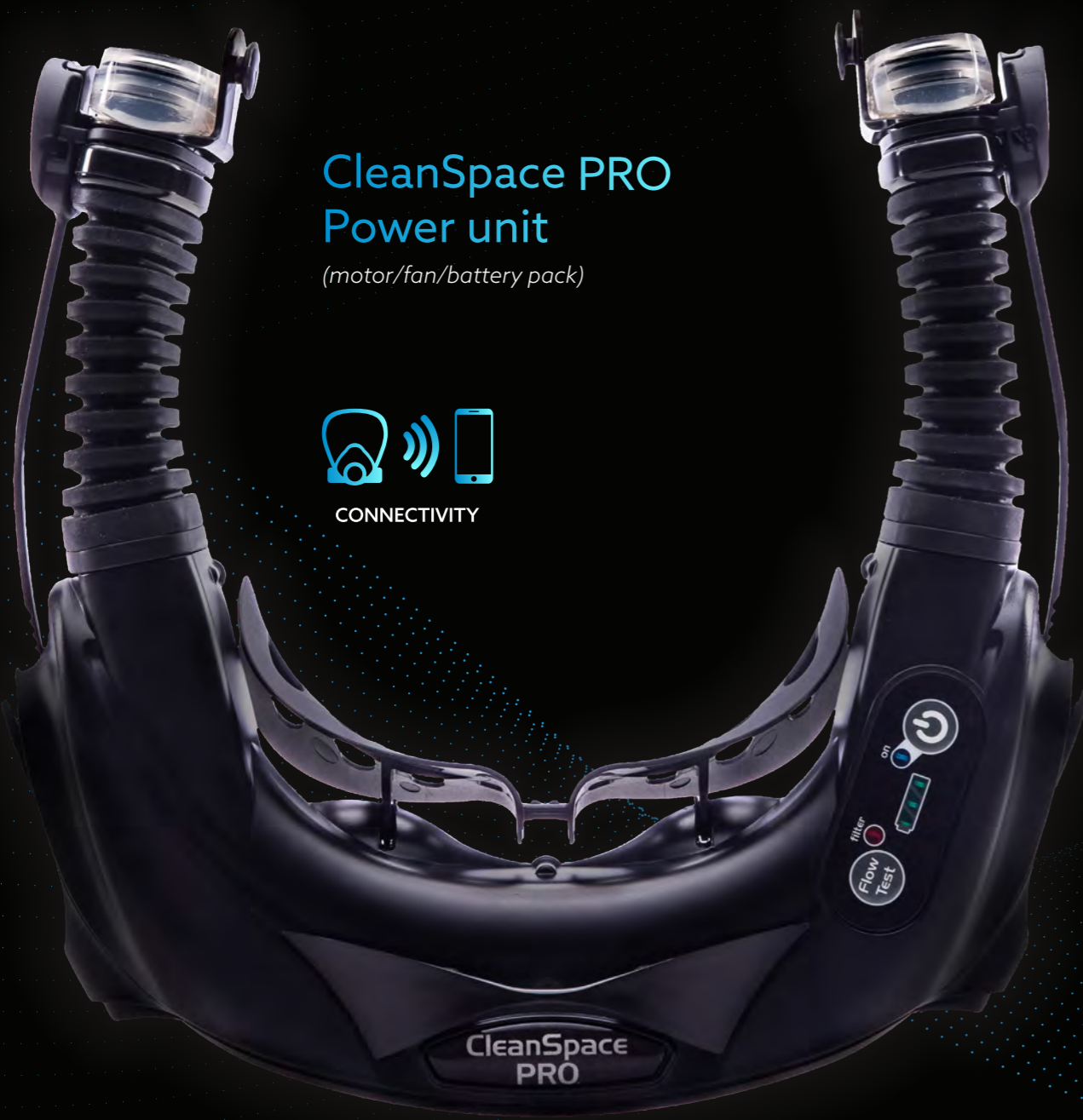
CleanSpace PRO Power unit (motor/fan/battery pack)