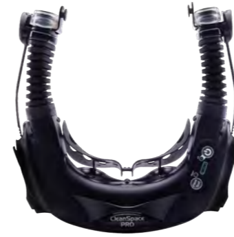
CleanSpace PRO CST1000

Power unit* includes neck supports, charger & carry bag *excludes mask and filter