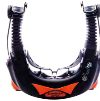
CleanSpace ULTRA CST1010

Power unit* includes neck supports, charger & carry bag *excludes mask and filter